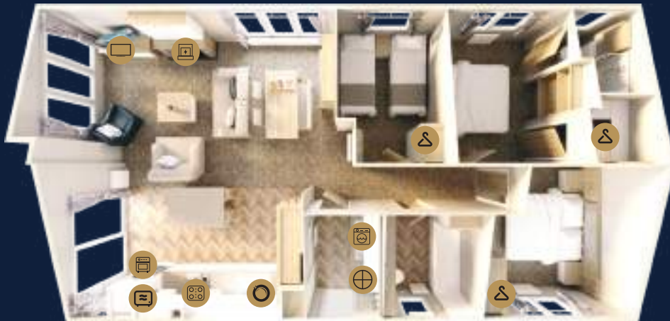
Pinehurst • 40 x 20 • 3 bedroom • sleeps 6