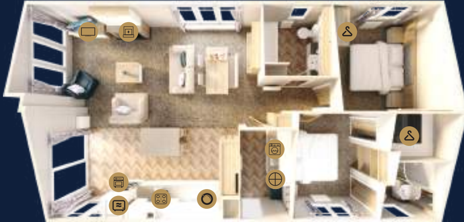
Pinehurst • 40 x 20 • 2 bedroom • sleeps 4